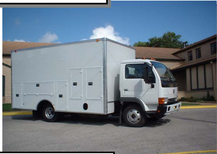
SPECIALTY, UTILITY and REFRIGERATION BODIES