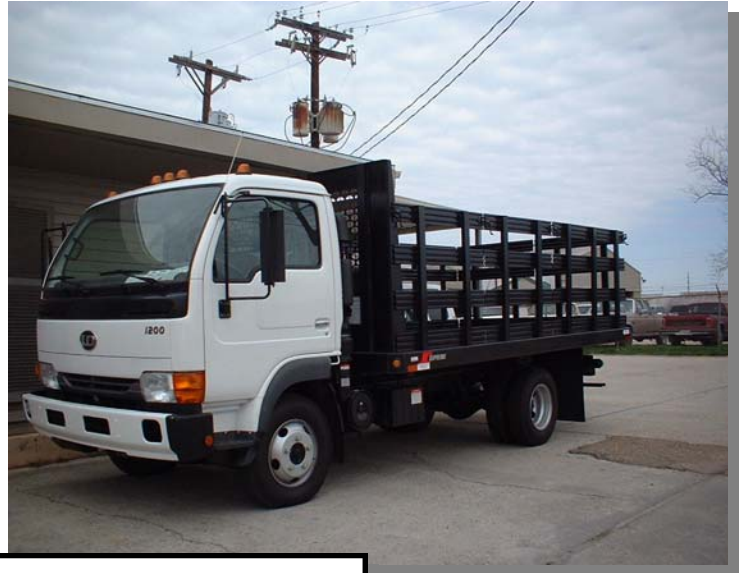
VAN-FREIGHT BODIES, FLAT BEDS, STAKE BEDS