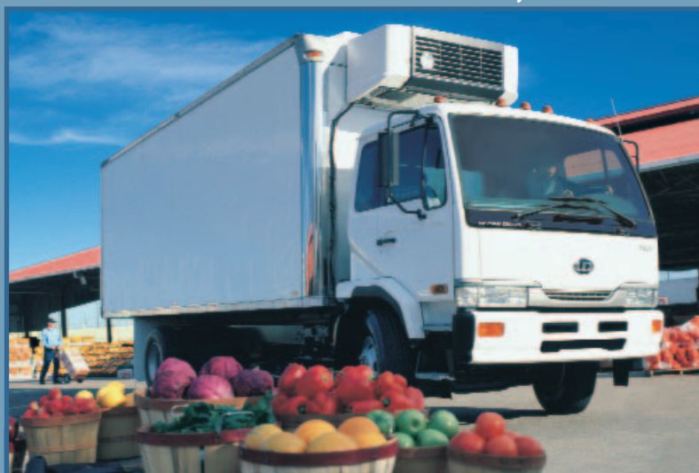
*UD3300 shown here with dealer installed optional equipment.