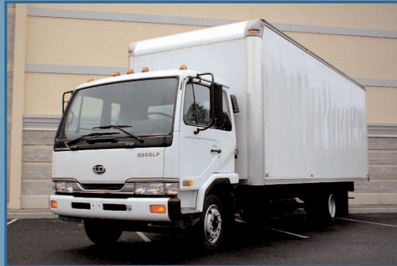
*UD2300LP shown here with dealer installed optional equipment.