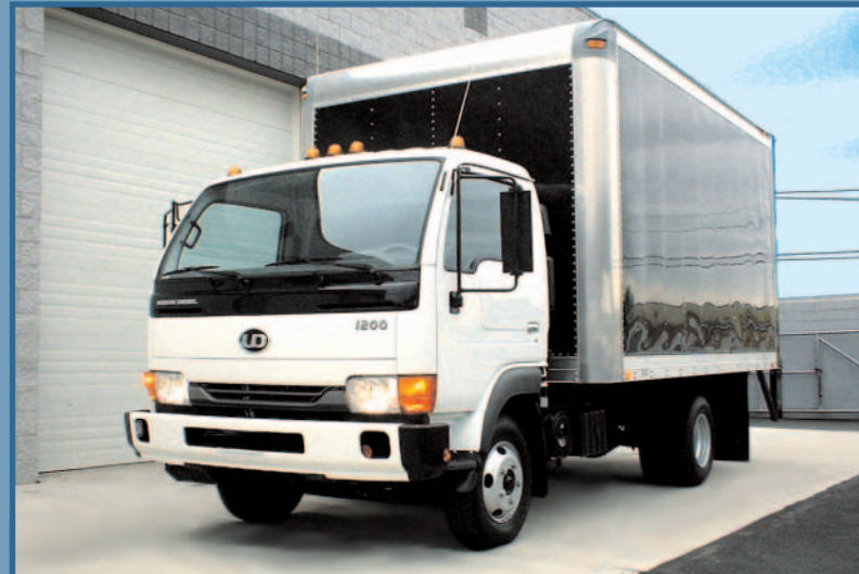
*UD1200 shown here with dealer installed optional equipment.